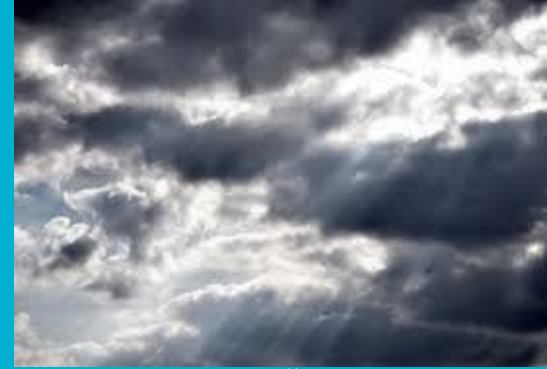
Cloudy = “Kumori” 曇り／くもり