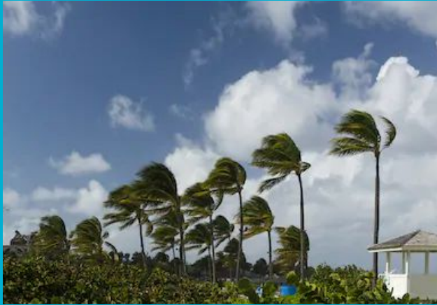
Windy = “Kaze ga tsuyoi” 風が強い／かぜがつよい