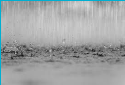
Raining = “Ame ga futte imasu” 雨が降っています