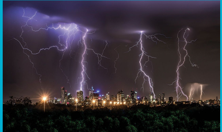
Lightning Storm = “Kaminari” 雷／かみなり