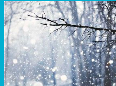
Snowing = “yuki ga futte imasu” 雪が降っています