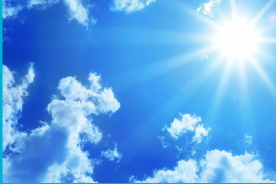
Sunny = “Hare” 晴れ／はれ